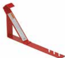
Roof Brackets (with wooden boards) To set down containers and tools