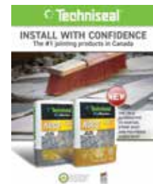
NOCO™ Polymeric Joint

Contact your local Techniseal® representative, visit techniseal.com or dial 1 800 465-7325 for more details.