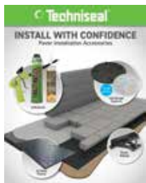
Paver Installation Accessories