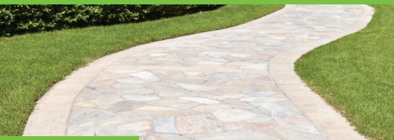
Easy to curve