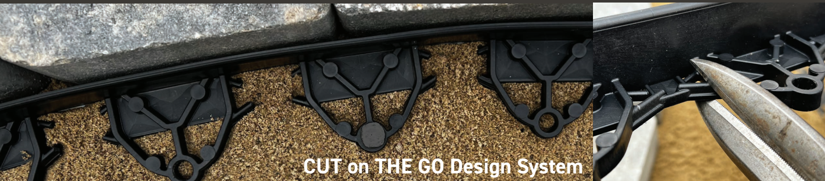
CUT on THE GO Design System