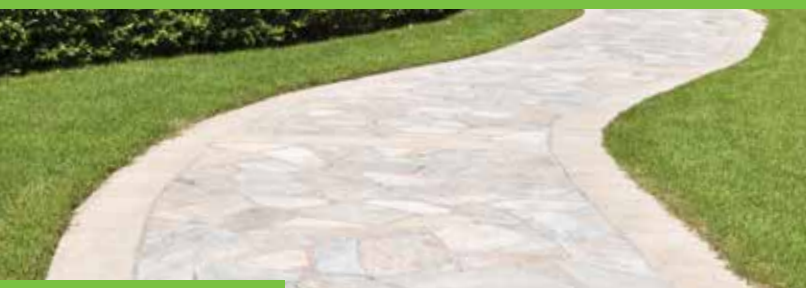
Easy to curve